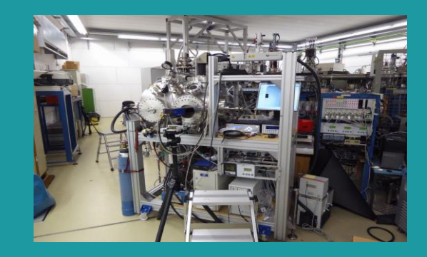
The experimental setup at GSI.

Droplets of supercooled water can also be found in the upper layers of the earth's atmosphere, where they exist under conditions similar to those created experimentally. <u>More information</u>